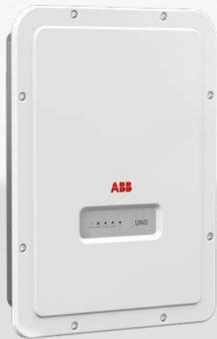
— UNO-DM-TL-PLUS-Q outdoor string inverter